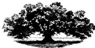
THE ZEIST FOUNDATION, INC.